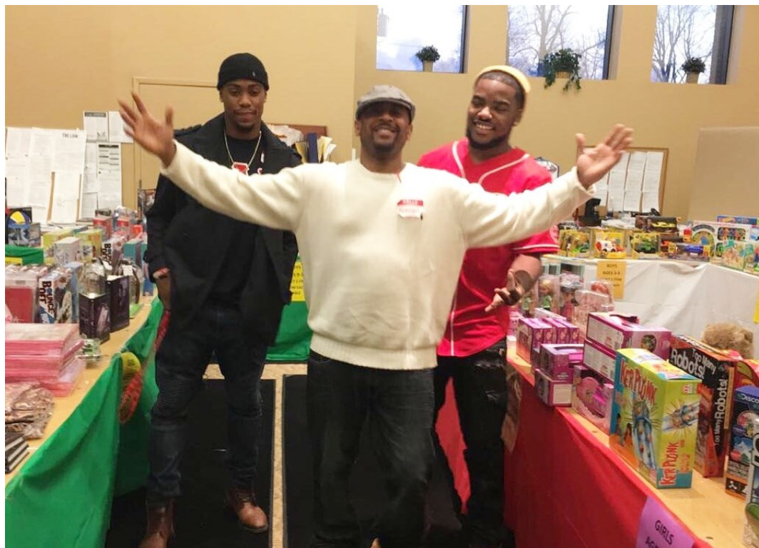
Brothers of the Phi Chapter hosting C.A.O.'s (Community Action Organization) annual Christmas Toy Drive for community families in need.