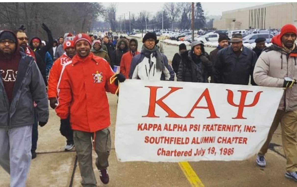
Southfield Alumni Chapter and Kappa League at the 2017 Southfield MLK Peace Walk .