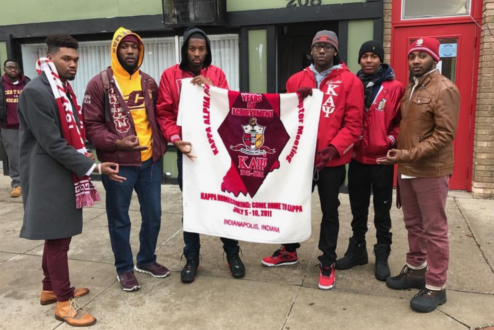
Eta Rho Chapter Participating in the MLK March and Vigil at Central Michigan University.